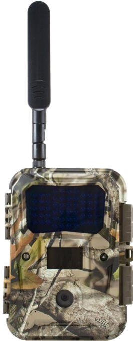
Model: Lookout LTE 4G Cellular Camera Model

PLEASE READ CAREFULLY BEFORE USING CAMERA